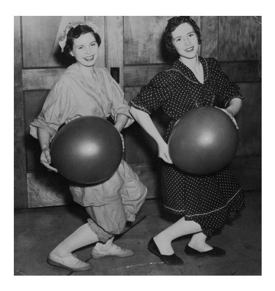
FEBRUARY "One thing is for certain: CrossFit looked a lot happier back in 1950."