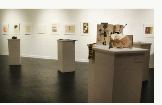
Inside Out: 11