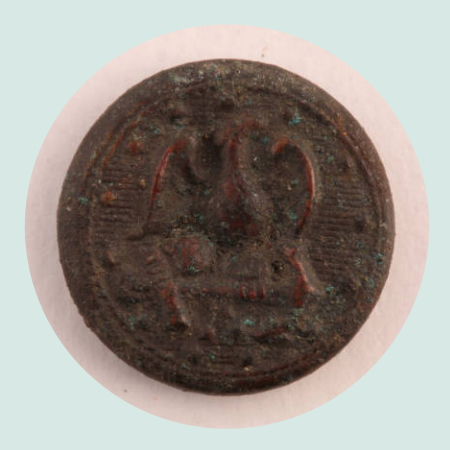
RANSOM PLACE COLLECTION

IUPUI Strategic Plan. While the library has been engaging with the community through digital collection creation for over 12 years (the majority of our historical digital collections are physically owned by other cultural heritage institutions, including libraries, historical societies, and community organizations), the Center offers an additional connection to our community partners.