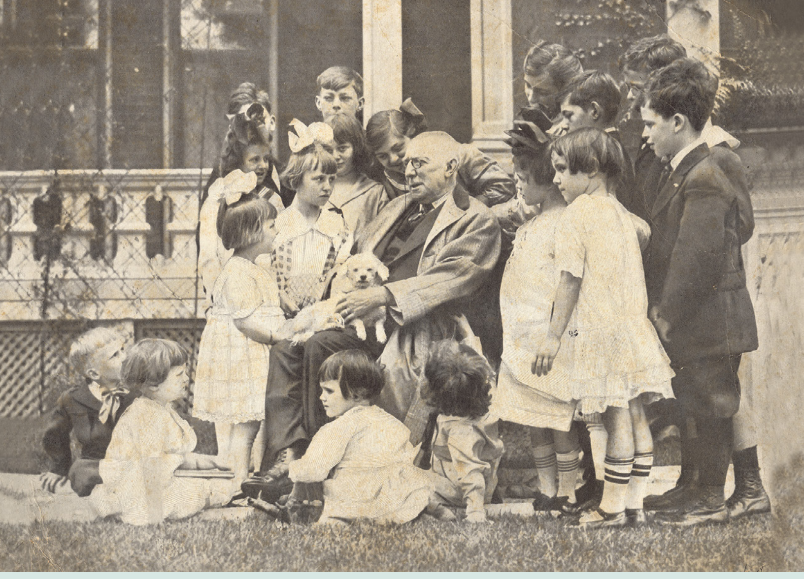
JAMES WHITCHOMB RILEY COLLECTION