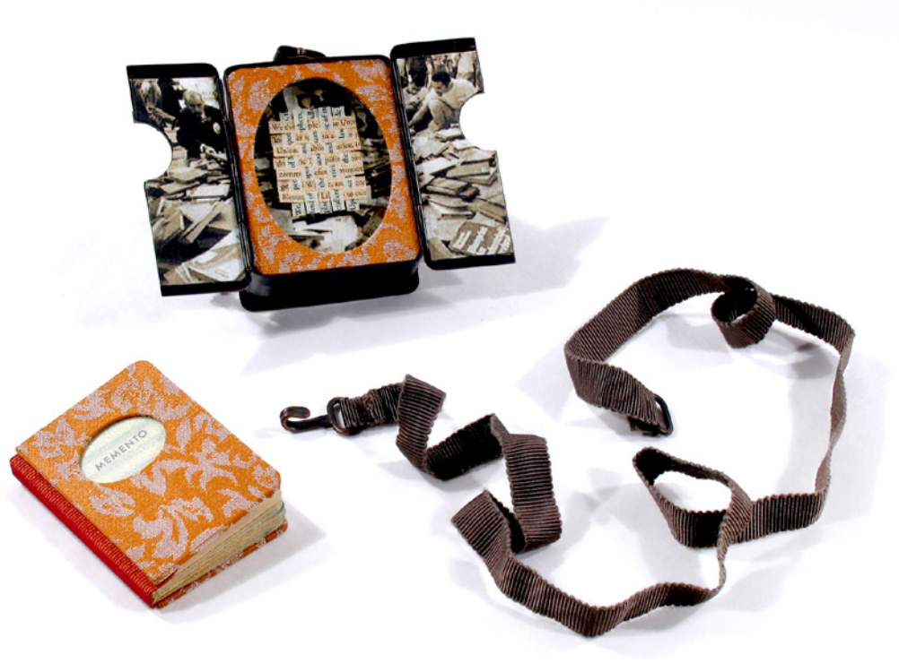
ARTISTS' BOOKS FROM AL-MUTANABBI STREET STARTS HERE COALTITION COLLECTION.

The coalition has agreed to donate a complete run of the Al-Mutanabbi Street Starts Here collection to the Herron Art Library. Valued at over $250,000, the Al-Mutanabbi Street Starts Here collection includes 260 artists' books; a publication entitled Al-Mutanabbi Street Starts Here: Poets and Writers Respond to the March 5th, 2007, Bombing of Baghdad's "Street of the Booksellers", plus 130 broadsides—one for every person killed or injured in the bombing of al-Mutanabbi Street. The Herron Art Library will be one of only three libraries worldwide to be a permanent home to the collection, and the only library in the U.S.