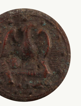
IUPUI Library's Digital Collections: 5