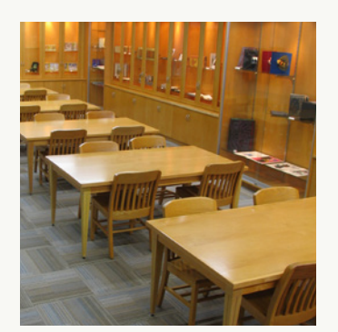
The Herron Art Library : 11