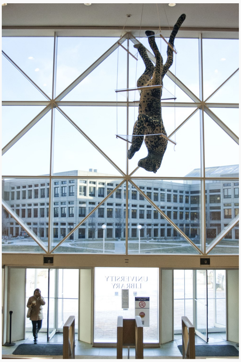
A PUBLICATION OF IUPUI UNIVERSITY LIBRARY

INDIANA UNIVERSITY – PURDUE UNIVERSITY INDIANAPOLIS